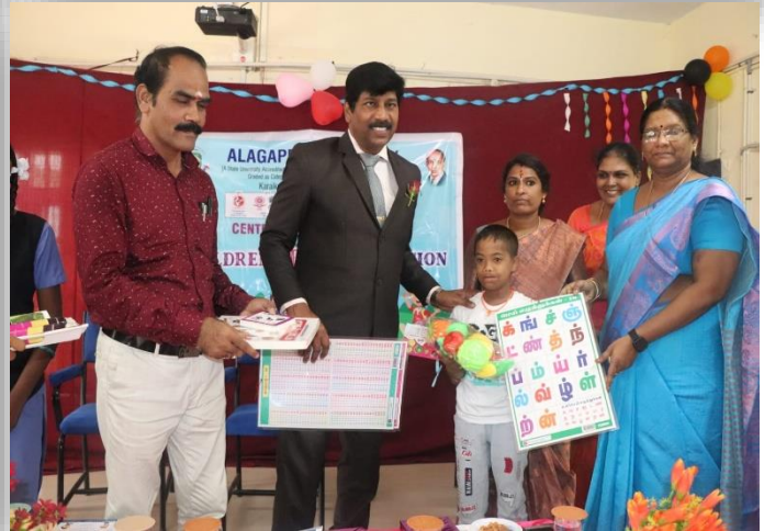
Honourable Vice-chancellor gave Assistive Learning Materials to Differently Abled students