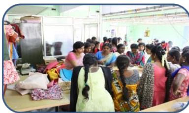
Jute Fabric Article