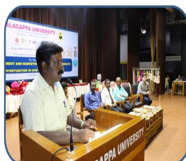
Vote of Thanks