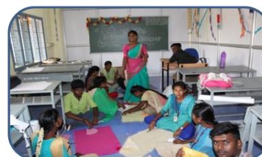
Fur Toy Making