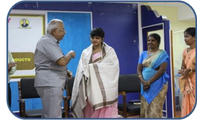
Honouring the guest