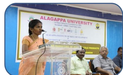
Vote of Thanks