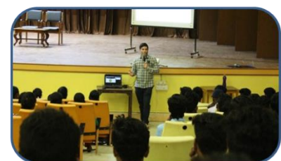
Imaging Techniques session