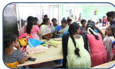
Jute Fabric Article